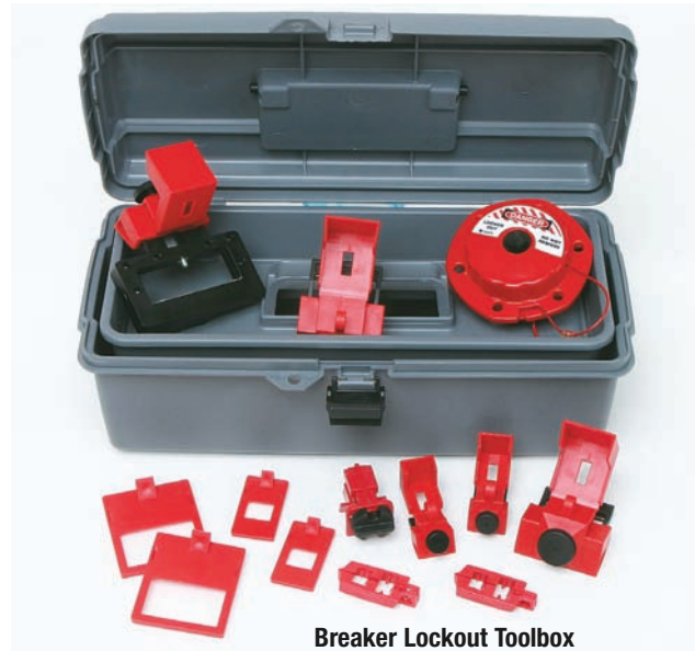
Breaker Lockout Toolbox