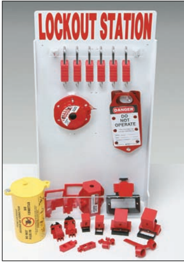
Small Lockout Station with Brady Safety Padlocks