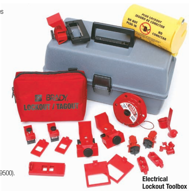
Electrical Lockout Toolbox